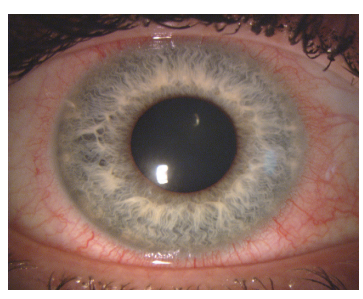
Figure 2: Low magnification diffuse light view of conjunctival hyperemia