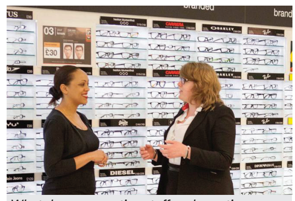
What do your practice staff and practice environment communicate?